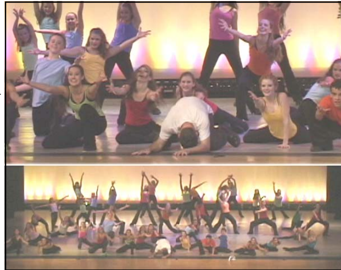
The Split-screen effect in action!

But enough of my whining! This marketplace reality is not your problem – like I said, it’s a challenge – It’s MY challenge! And I welcome it! You and your students deserve to receive a quality video production, and it’s our responsi-